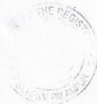
Registrar CSKHPKV, Palampur